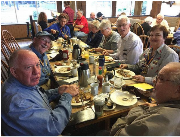
Golden Gavel Gang Breakfast – Governors